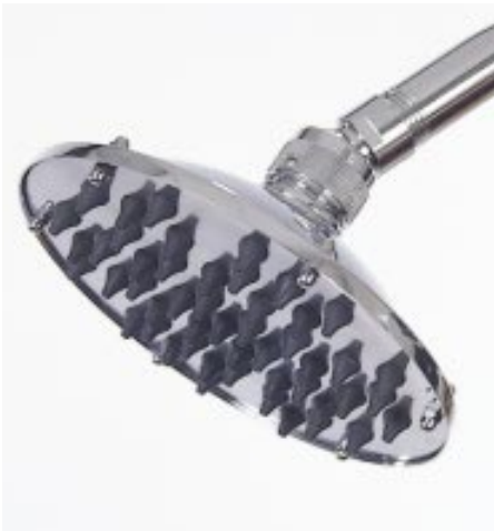
Figure 3. Big-diameter multi-jet showerheads, like this one from Jaclo, provide a rainshower effect by increasing the area of shower coverage with up to 90 jets in a single head. Rubber nibs dislodge mineral deposits at the flick of a finger.