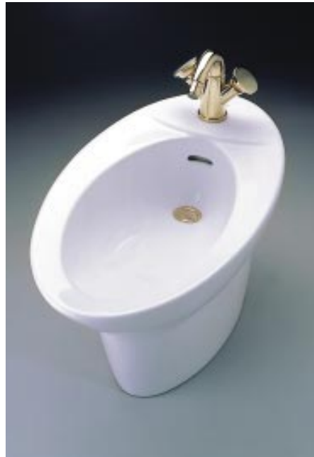
Figure 5. The bidet is struggling onto our shores in growing numbers and versions, from “multi-tasking” heated toilet-seat replacements (Toto’s Chloe, $700, at left) to dedicated fixtures. The preferred location for a dedicated bidet (right, from Toto) is adjacent to the toilet.

merging global cultures is the growing promotion of bidets and toilet/bidet combinations, with retractable water jets and adjustable pressure (Figure 5). Taken for granted elsewhere, bidets — like soccer, until recently — are still playing catch-up in the U.S. The Kitchen and Bath Business 2000 Market Forecaster predicts that around 98,000 bidets will be installed in the U.S. this year. Just don’t call it a Euronal.