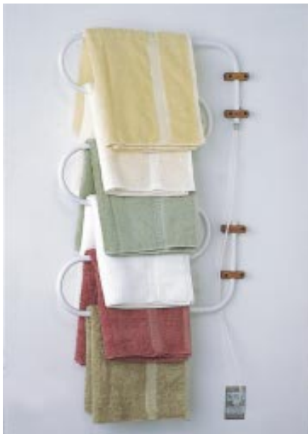
Figure 6. Towel warmers win instant converts on contact. Hinge-It’s electrically heated Model 3200 (above) starts at $120 in coated steel, with stainless steel and brass tubing available at a higher cost.